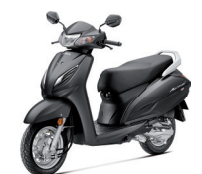
Matte Axis Grey Metallic