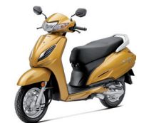
Dazzle Yellow Metallic