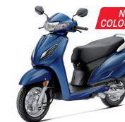
Glitter Blue Metallic