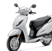
Pearl Precious White