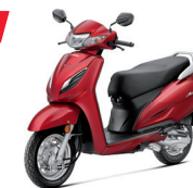
Pearl Spartan Red