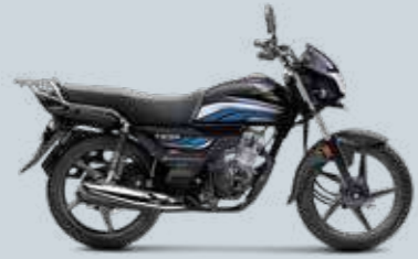
Black with Blue