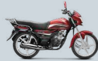
Imperial Red Metallic