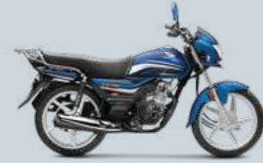
Athletic Blue Metallic