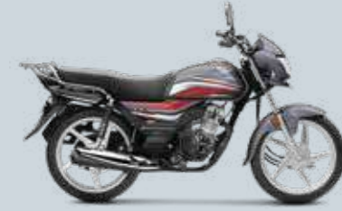
Geny Grey Metallic