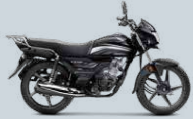
Black with Grey