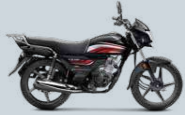
Black with Red