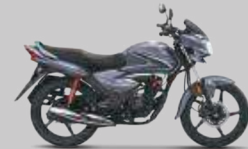
GENY GREY METALLIC