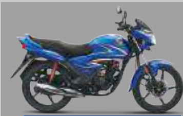
ATHLETIC BLUE METALLIC